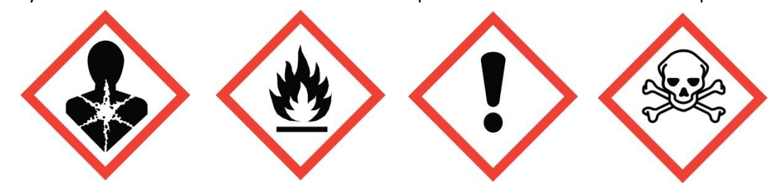
Section 3: Composition/Information on Ingredients